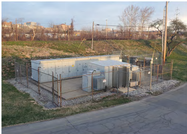
Substation No. 1 & Switchgear