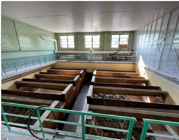
Filter #1 Drained for Rehabilitation